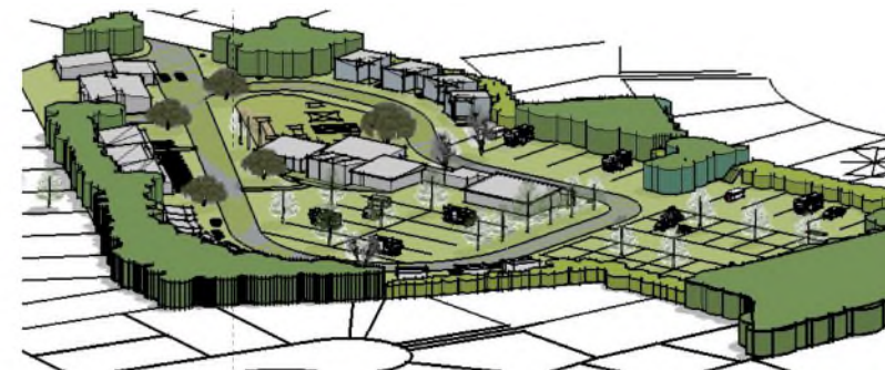
1 - Perspective of Campground from Airport Drive looking west (approx elevation 250 m), showing the two types of mass planting around boundaries (lower shrub and taller tree planting), and within the campground specimen and screening planting.