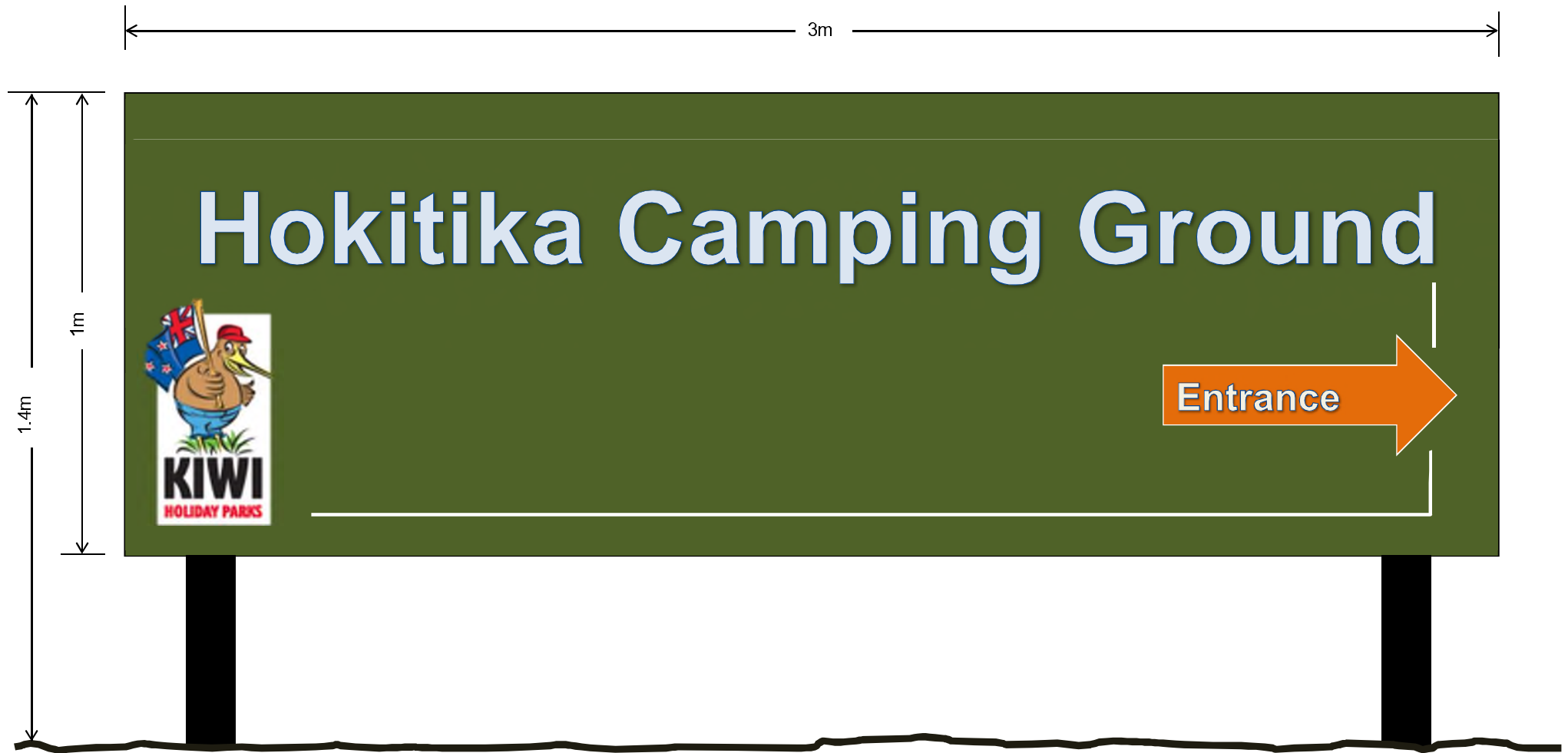
Figure 8 Sign Elevation The proposed sign to be located at the Davie Street entrance.