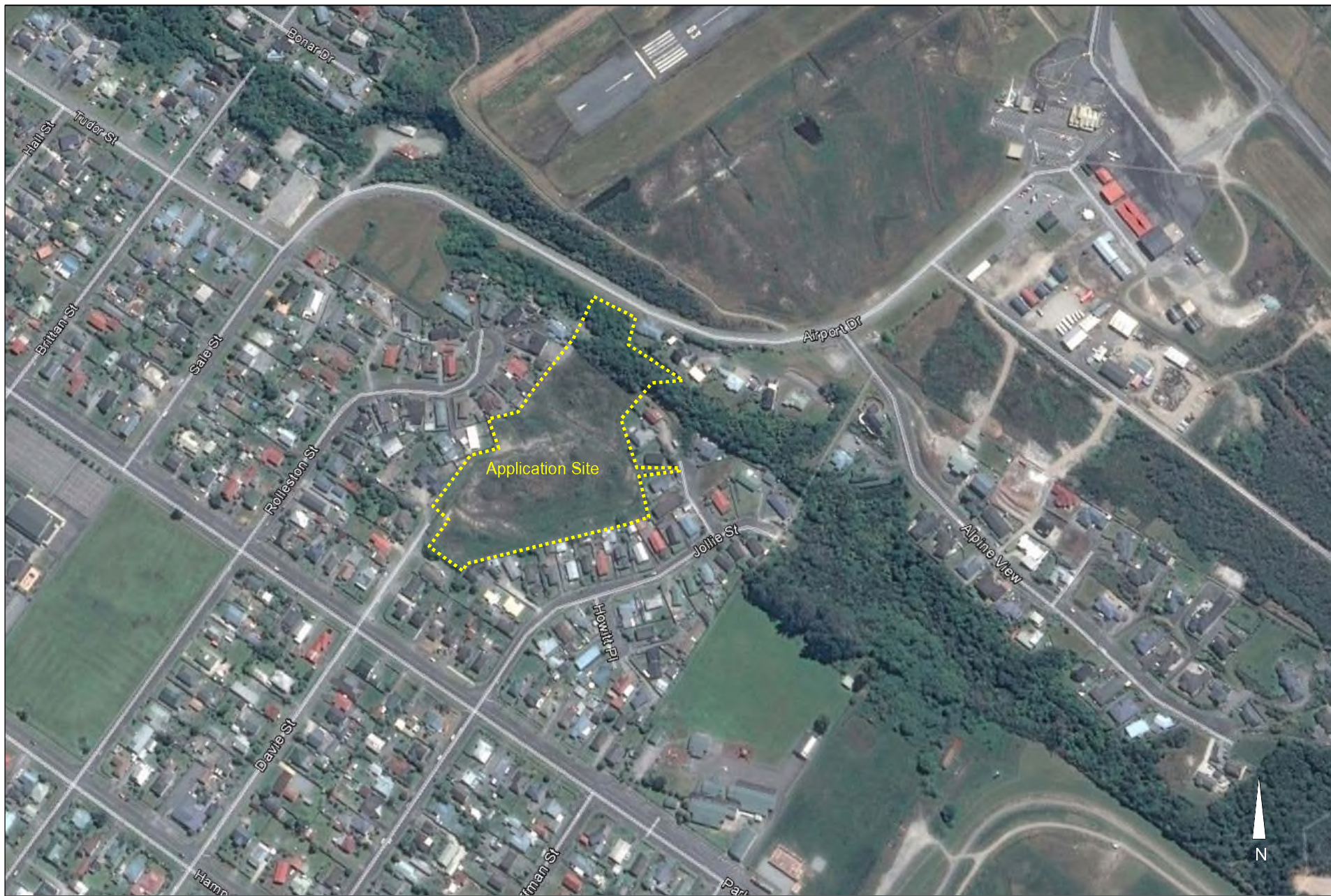
Figure 1 The location and extent of the application site in its wider setting