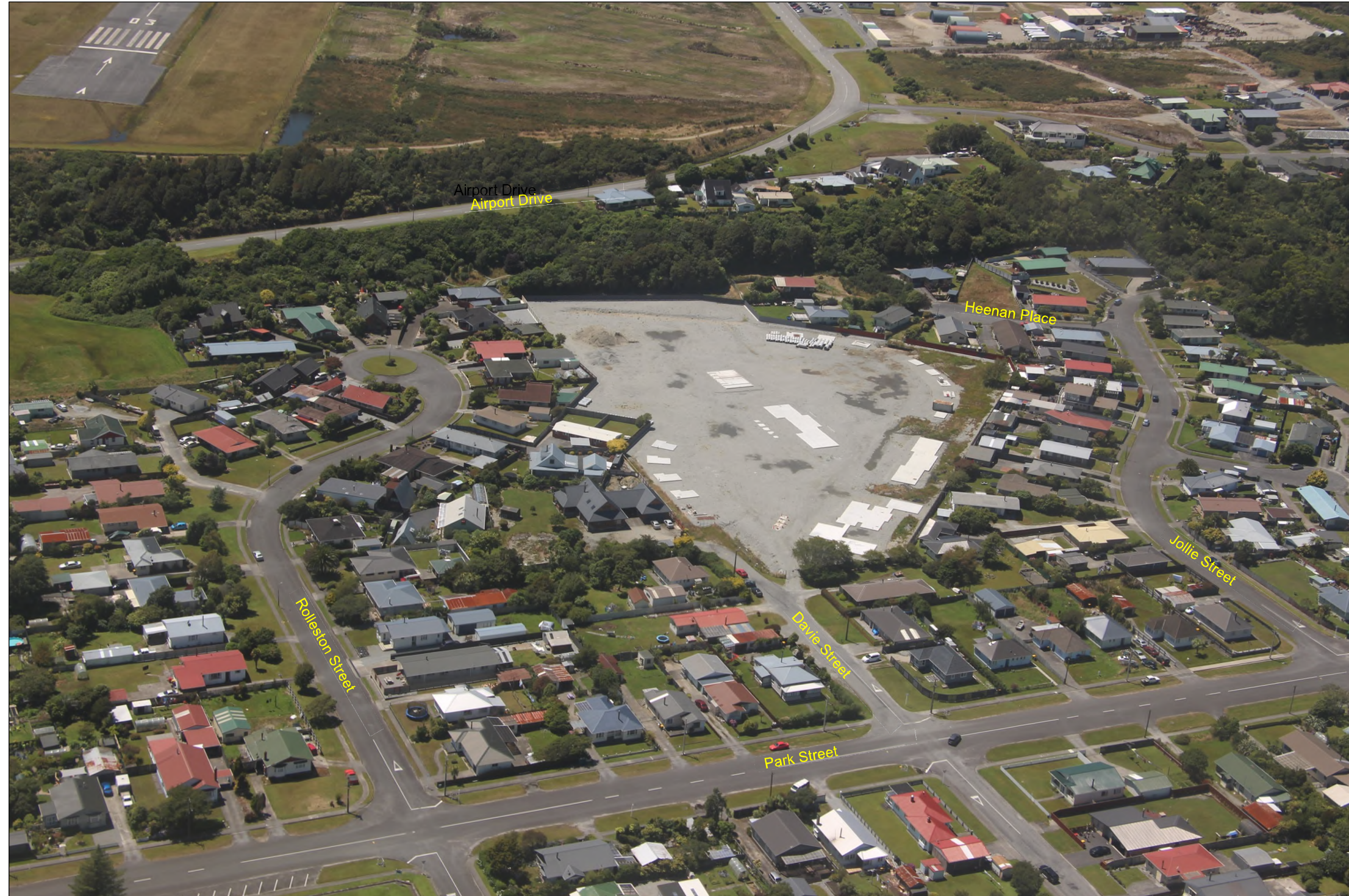
Figure 6 The application site in its wider setting. Its extent is evident in the photograph.