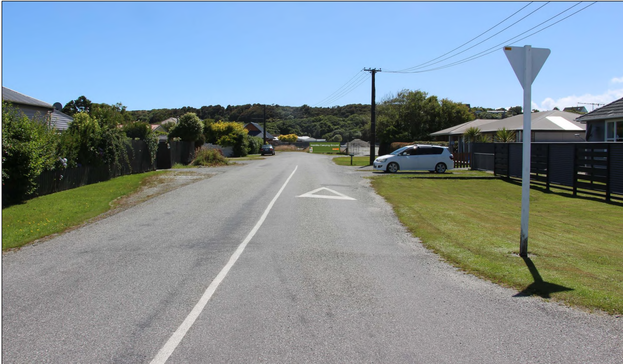
Figure 9 Photomontage showing the effect of the proposed sign as viewed from the intersection of Park and Davie Streets. The sign will be back dropped by vegetation which will have the effect of reducing its apparent extent.