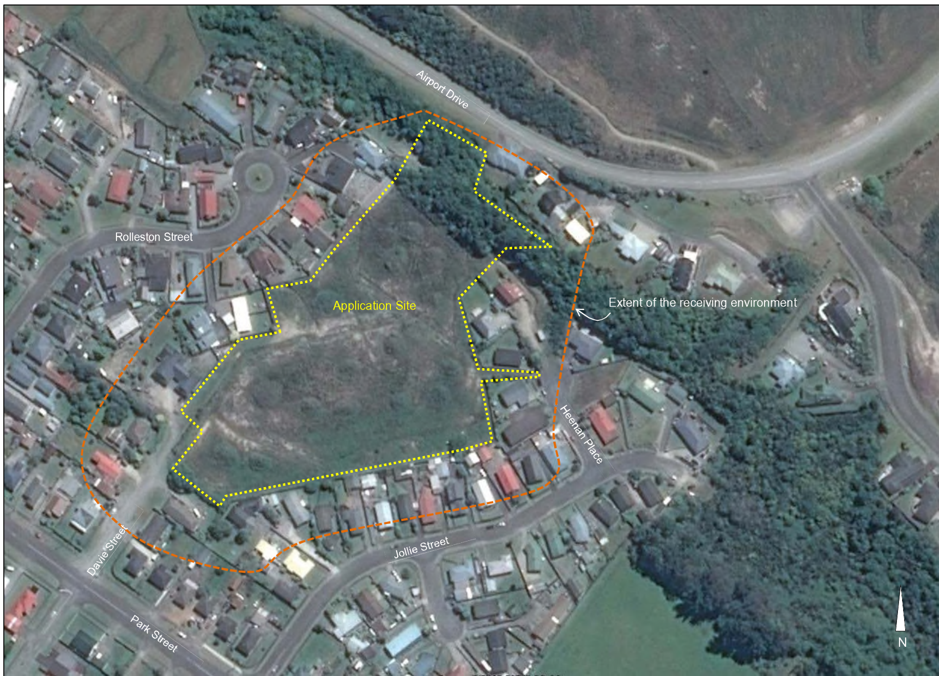
Figure 2 The extent of the receiving environment with respect to landscape and visual effects