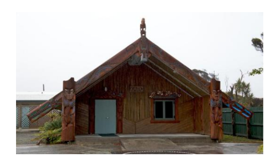
Te Tauraka Waka a Māui marae