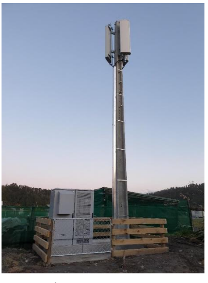
RCG - Okarito Lagoon