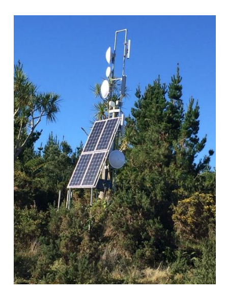
WiFi Connect - Hokitika