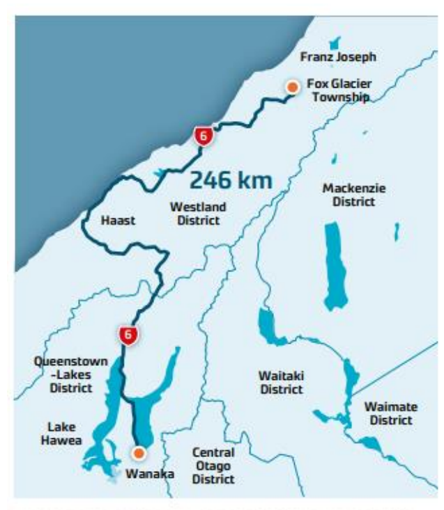
FOX GLACIER - HAAST - LAKE HAWEA FIBRE LINK