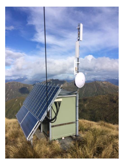
WiFi Connect - Mt French