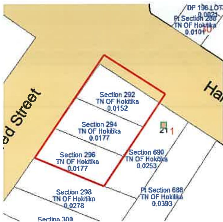
Figure 5: Quickmap showing Secs 292, 294 and 296 (CT WS2C/373) and Legal Road, Westland Land District, with the red polygon marking the approximate extent of the List Entry, including the area of the footpath.