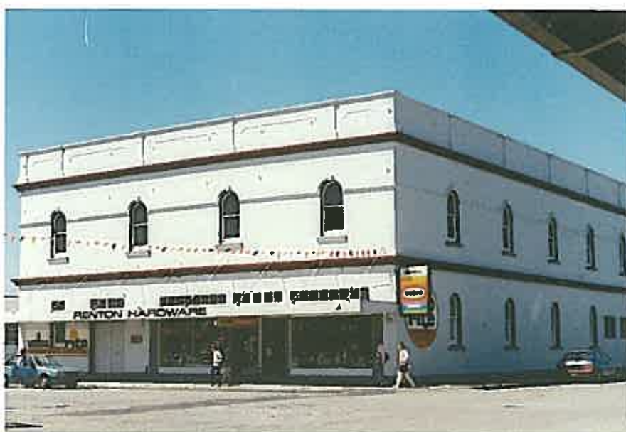
Figure 8: Renton Hardware, Trish McCormack, December 1988 (New Zealand Historic Places Trust Building Record Form 5050)