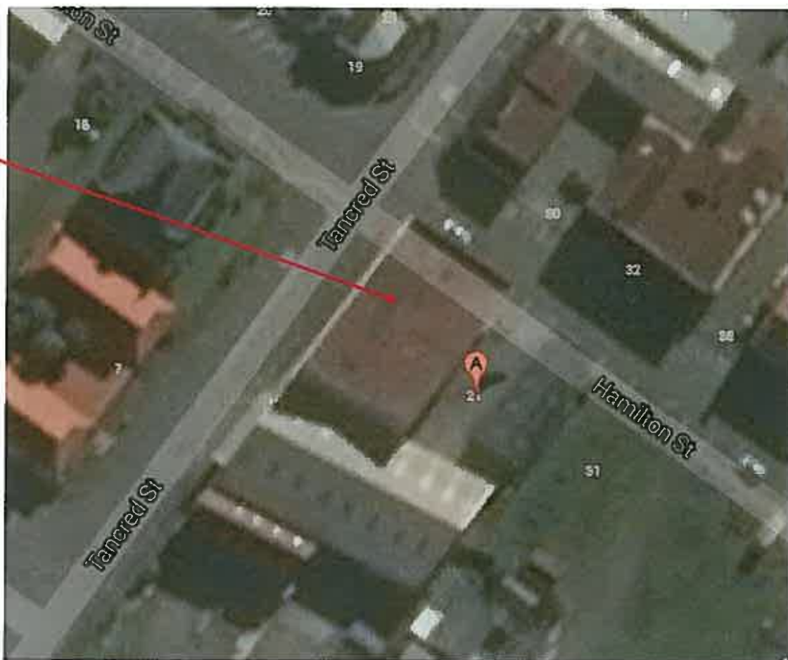
Figure 7: Google Aerial view showing the Renton Hardware Building as marked by arrow (image 2013)