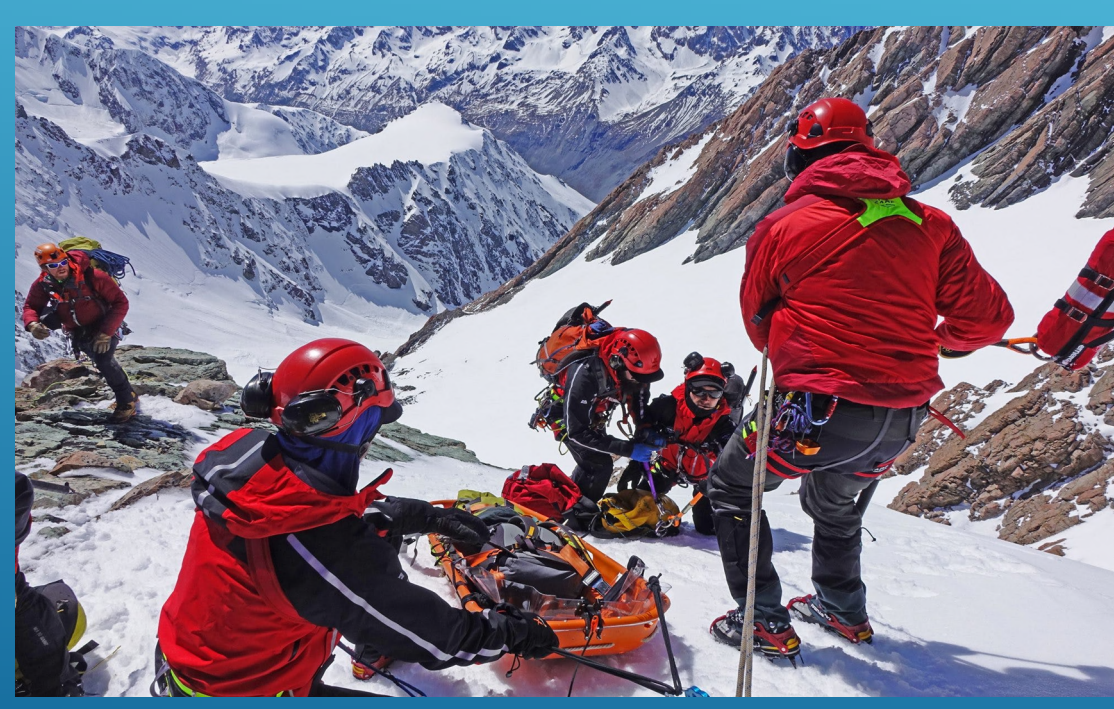
Exhaustive search and rescue operation for missing kiwi bird in mountain range | Newshub