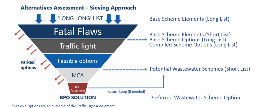
Figure 2: Assessment of Alternatives - Sieving Approach