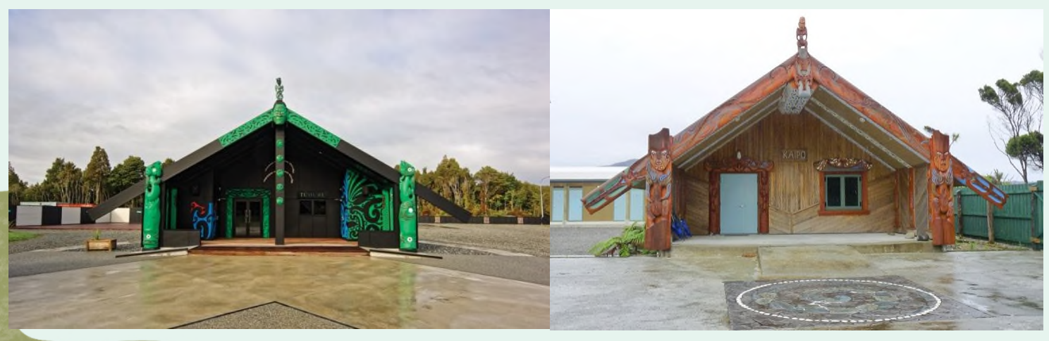
Arahura and Bruce Bay Marae

With Te Runanga o Ngati Waewae and Te Runanga o Makaawhio, to achieve conservation outcomes across the region