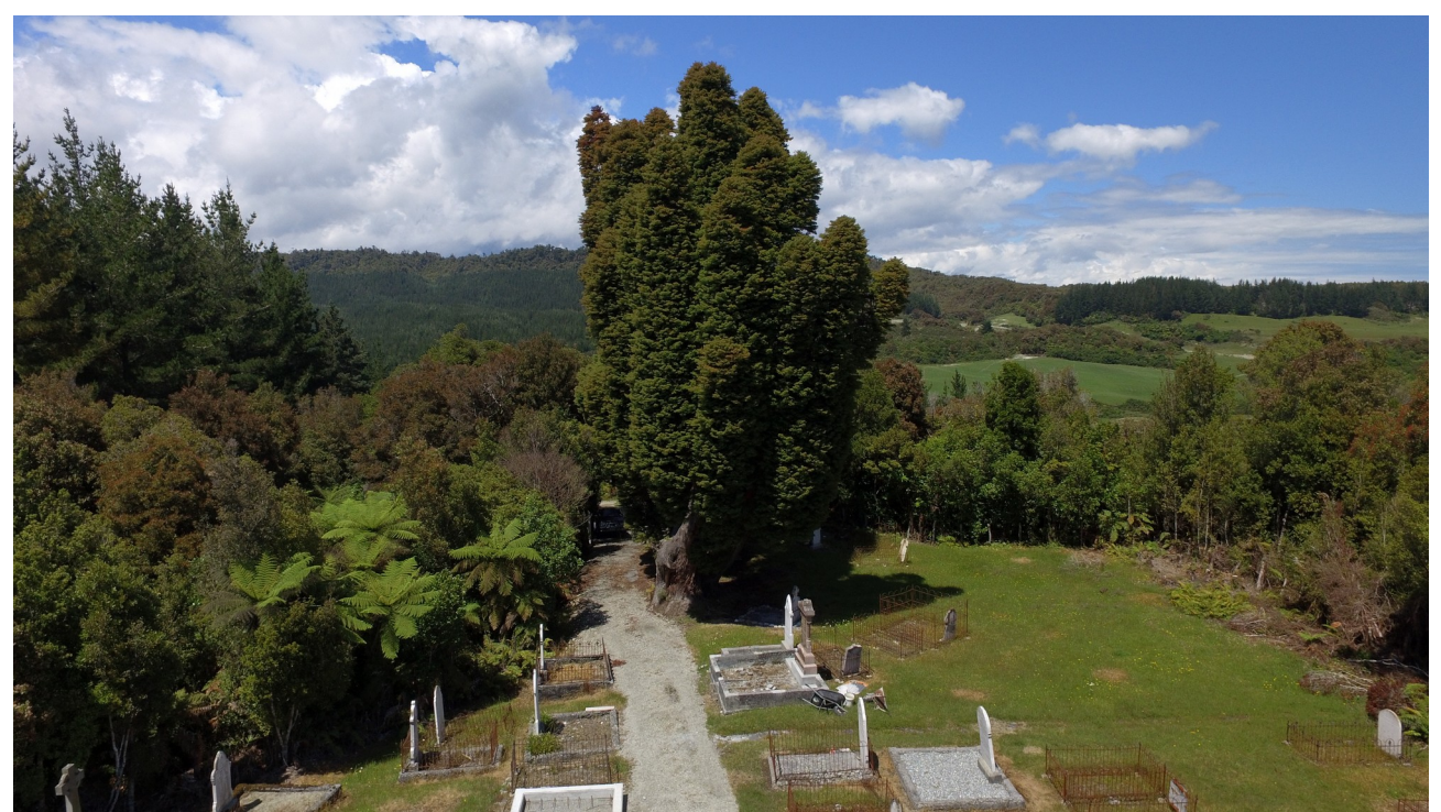
Japanese Red Cedar and Old Section