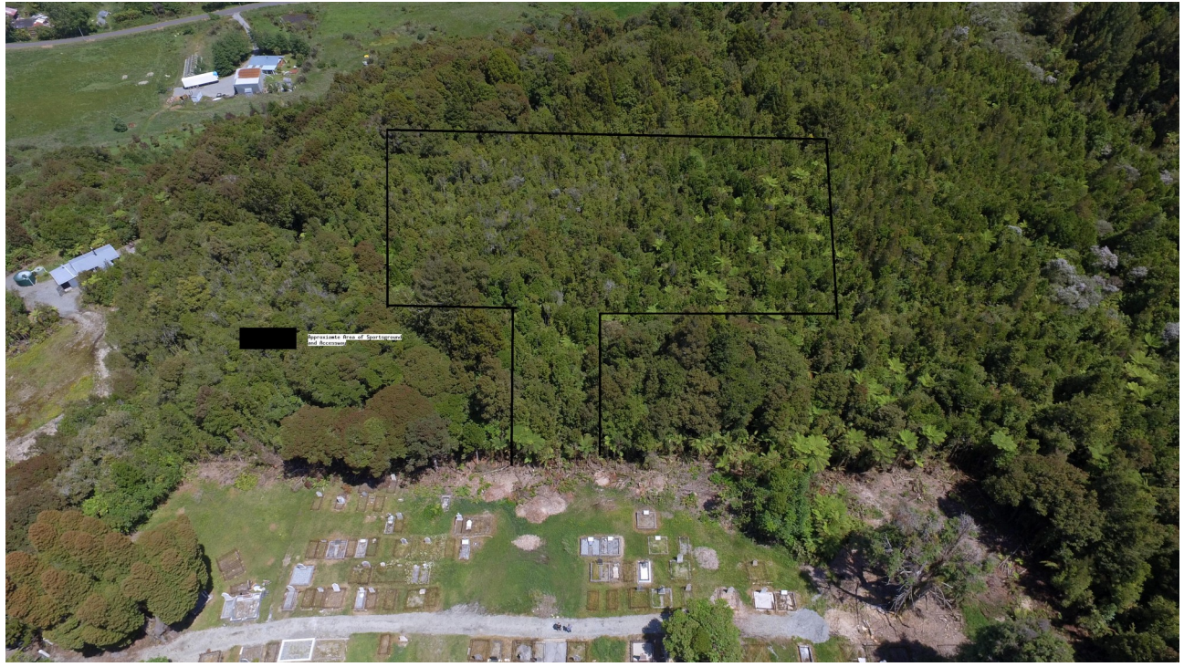
Approximate location of Sports Ground and Access Way