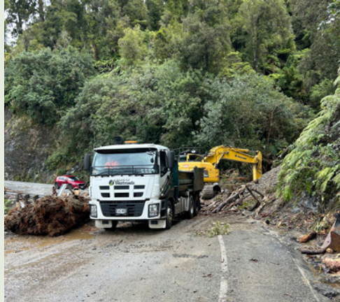
Whataroa crew responding to emergency works on the Fox hills after a storm event.