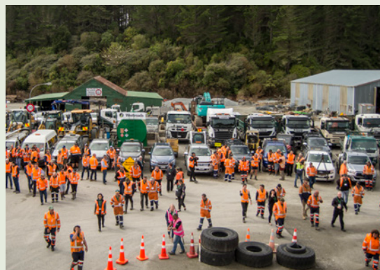
Celebrating 25 years.

The loss of the Grey District Council roading contract at the end of the 2022-23 financial year was a major setback, resulting in a right-sizing exercise into the 2023-24 financial year. We minimized the impact of this by redeploying five employees to vacancies in our Hokitika branch and selling approximately $1 million worth of equipment to match the reduced workload. Of the remaining Grey District operations, our Parks and Reserves maintenance contracts performed well, and the Screening and Crushing division made significant improvements, contributing positively to our group profit. Staff numbers reduced by 11 now down to 15.