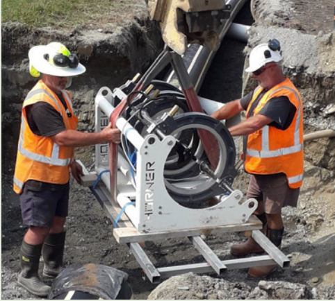
Coast to Coast Team carrying out PE pipe welding at a job in Christchurch.