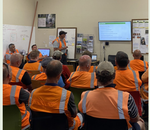
West Coast Crew participating in a Re-Induction Health & Safety training session.