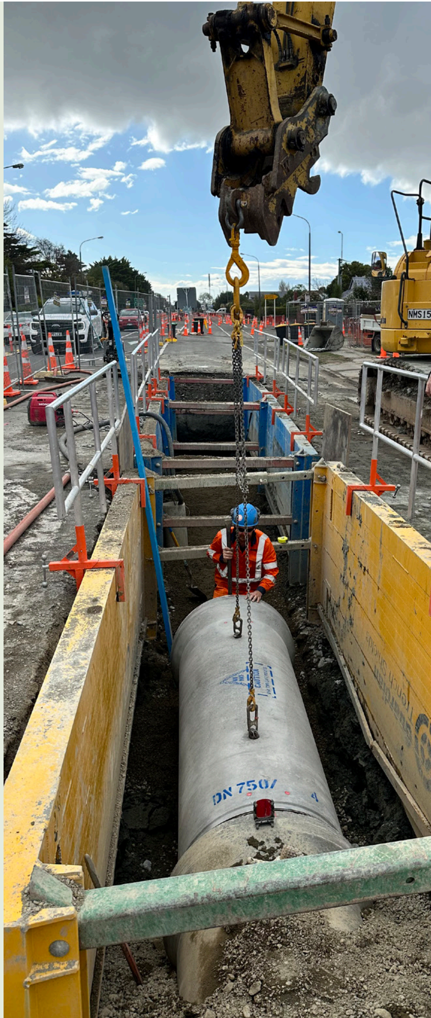
TD Crew working on the Halswell Road Drainage Job.